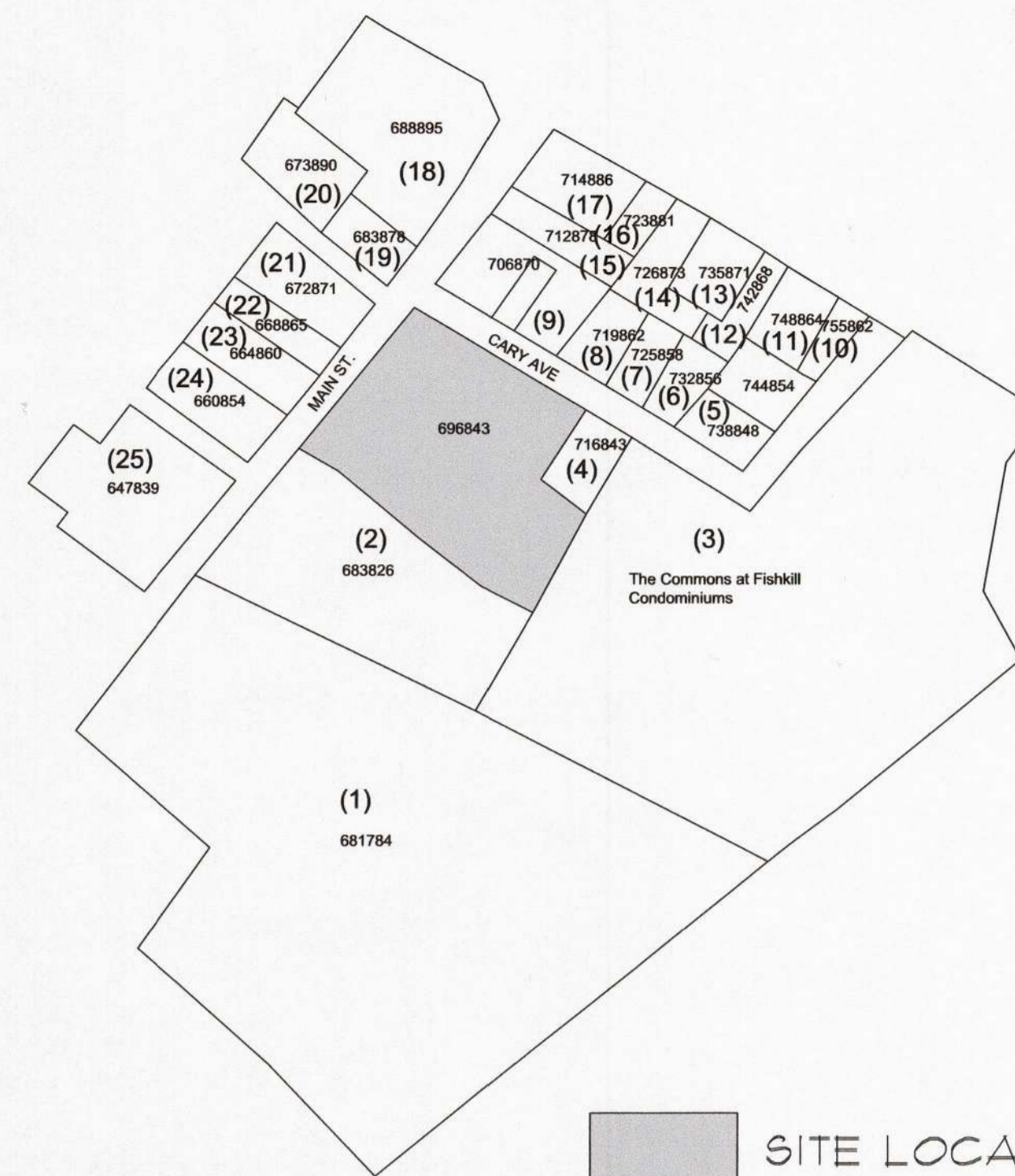
ADJACENT PROPERTY OWNERS SCALE: 1" = 1,000 S.F.

SEWER DISTRICT: VILLAGE OF FISHKILL SEWER DISTRICT WATER DISTRICT: VILLAGE OF FISHKILL WATER DISTRICT