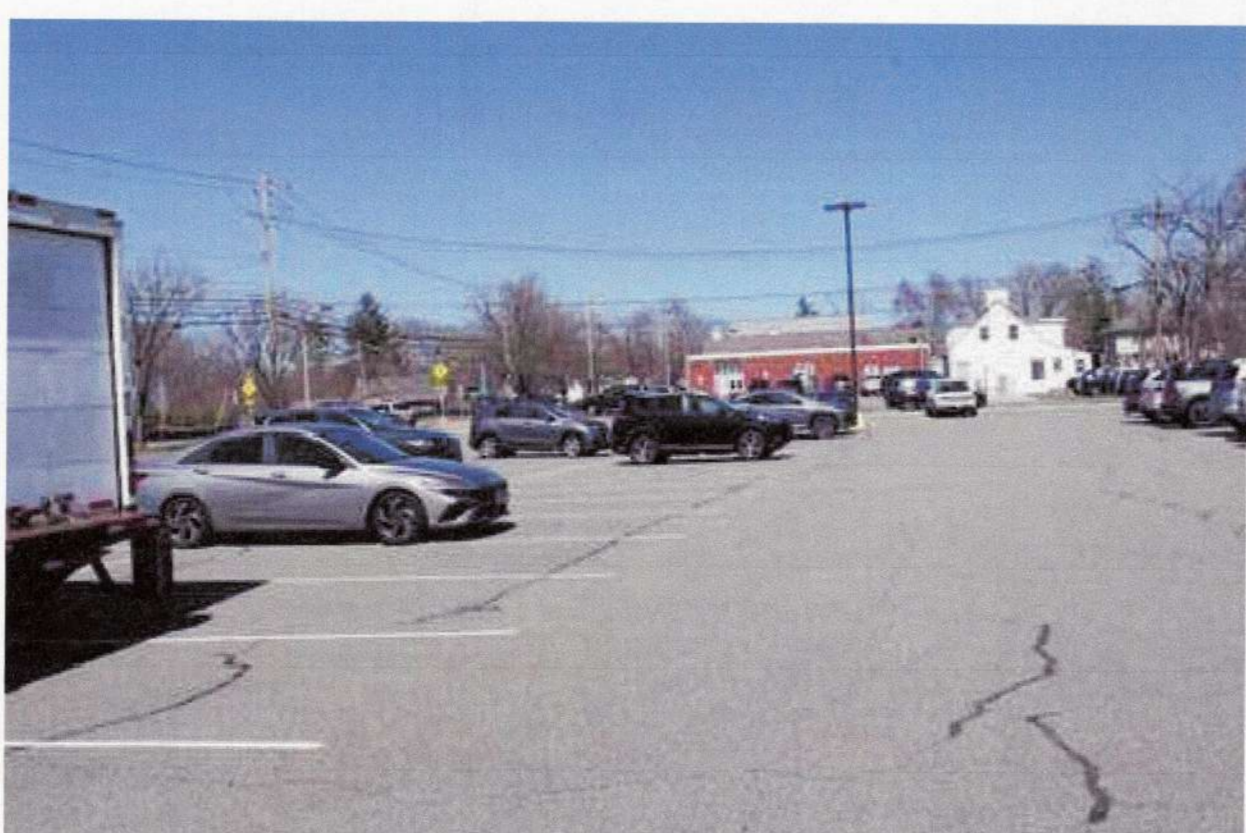
DATE: 4/1/2025 TIME: 2:30PM