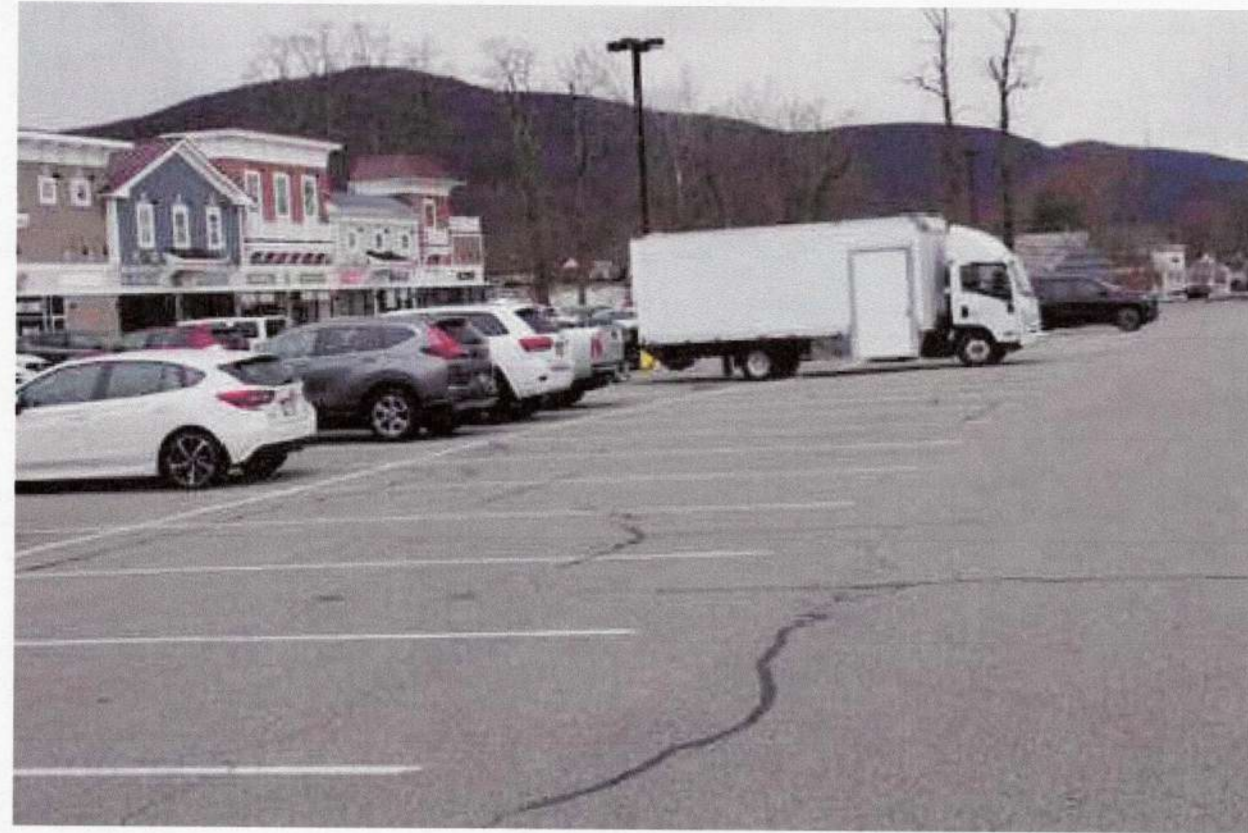
DATE: 3/26/2025 TIME: 1:50PM

SPACES OCCUPIED SPACES AVAILABLE SPACES PROVIDED 47 55 102 SPACES 41 79 120 SPACES