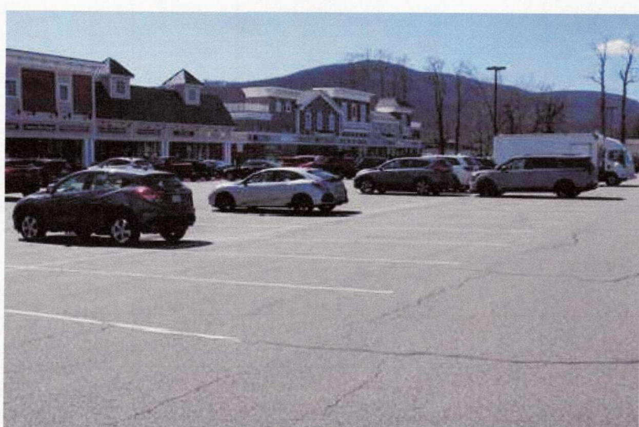
DATE: 3/27/2025 TIME: 11:30AM