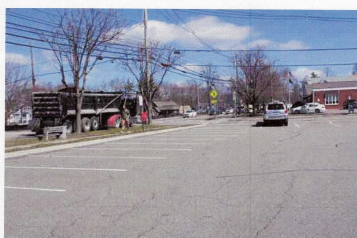
DATE: 3/27/2025 TIME: 11:30AM