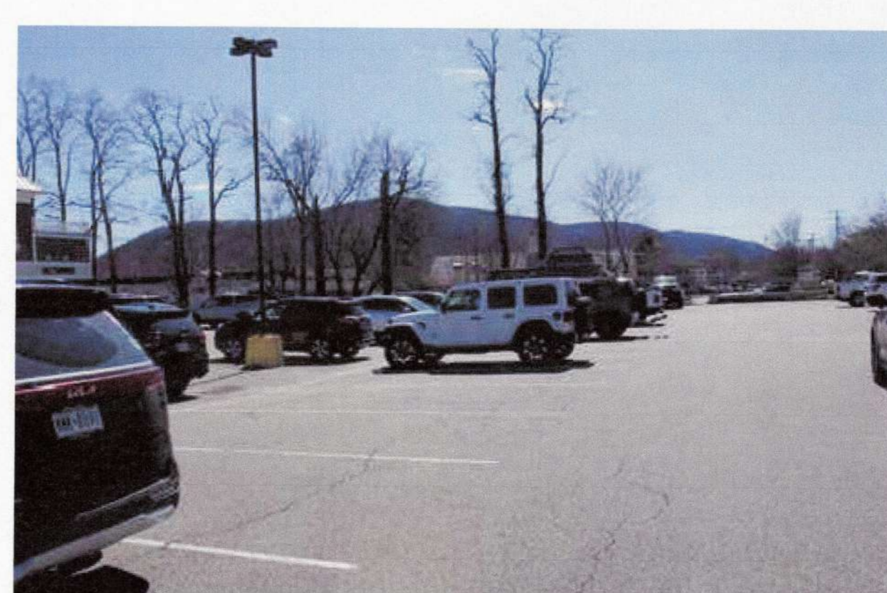
DATE: 4/1/2025 TIME: 2:30PM

SPACES OCCUPIED SPACES AVAILABLE SPACES PROVIDED 50 52 102 SPACES 38 82 120 SPACES