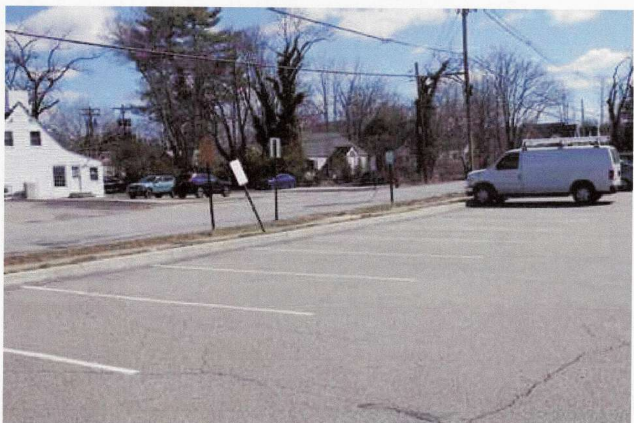
DATE: 3/27/2025 TIME: 11:30AM

SPACES OCCUPIED SPACES AVAILABLE SPACES PROVIDED 41 55 102 SPACES 49 71 120 SPACES