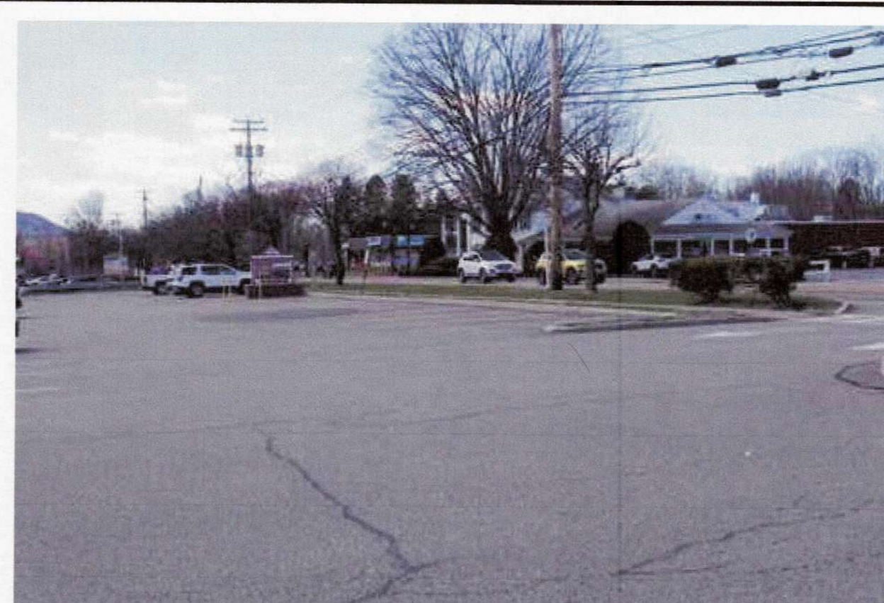
DATE: 3/25/2025 TIME: 1:30PM