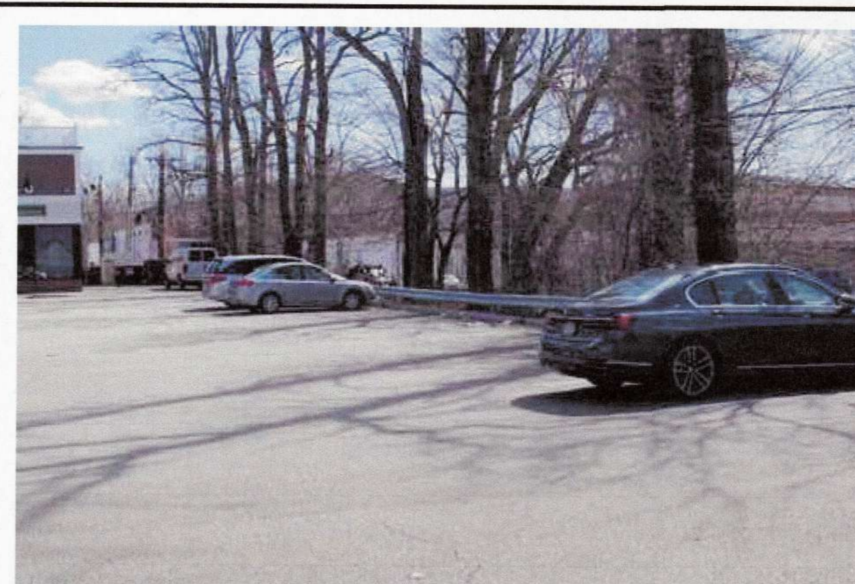
DATE: 3/25/2025 TIME: 1:30PM

SPACES OCCUPIED SPACES AVAILABLE SPACES PROVIDED 47 55 102 SPACES 41 79 120 SPACES