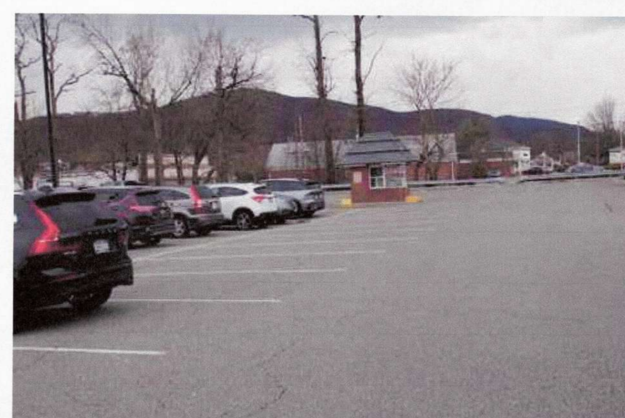
DATE: 3/26/2025 TIME: 1:50PM

SPACES OCCUPIED SPACES AVAILABLE SPACES PROVIDED 41 55 102 SPACES 49 71 120 SPACES