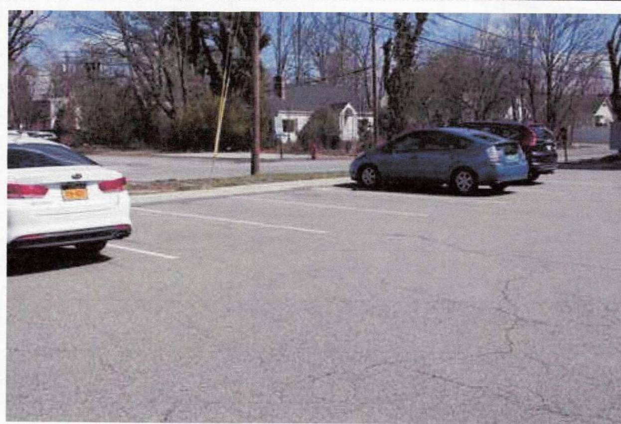
DATE: 3/25/2025 TIME: 1:30PM