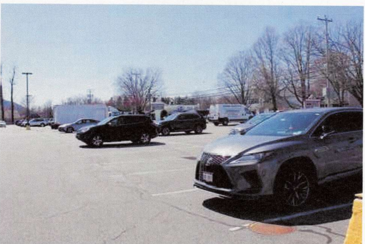
DATE: 4/1/2025 TIME: 2:30PM

SPACES OCCUPIED SPACES AVAILABLE SPACES PROVIDED 35 61 102 SPACES 32 88 120 SPACES