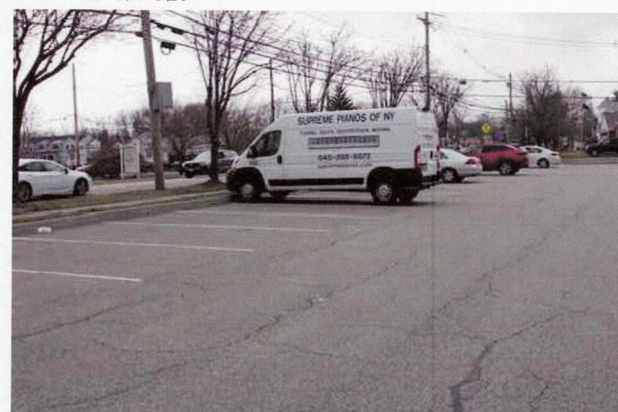
DATE: 3/26/2025 TIME: 1:50PM