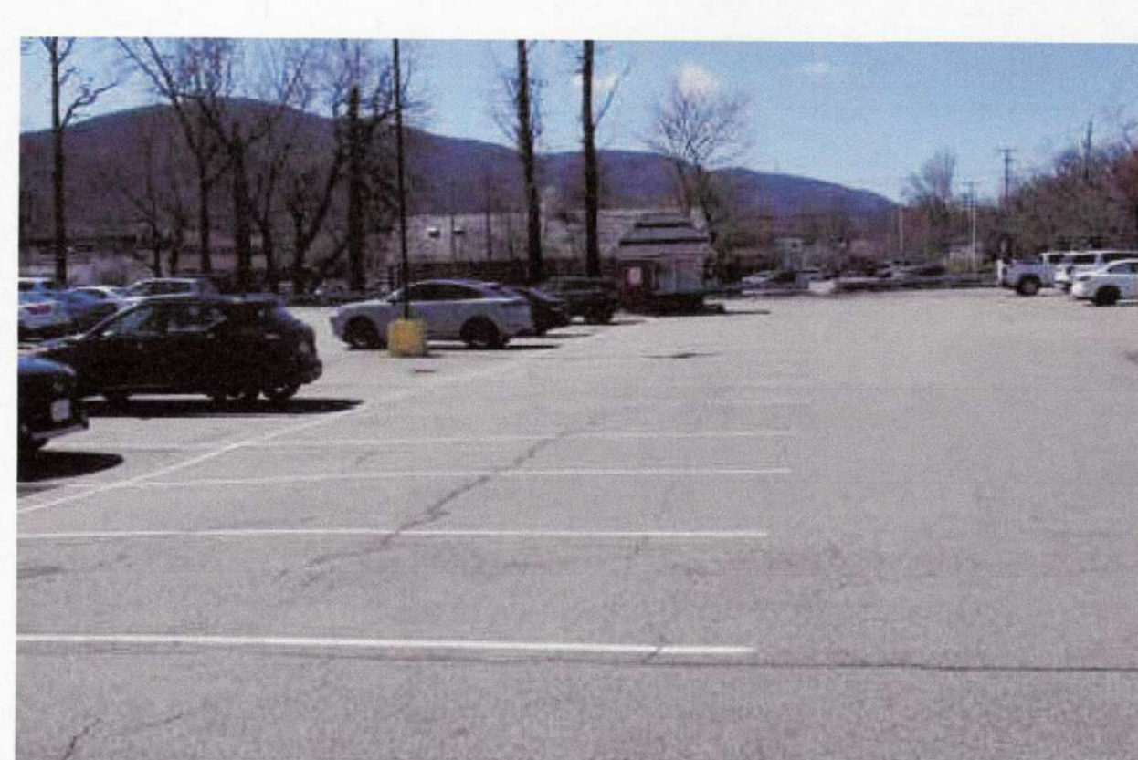
DATE: 3/27/2025 TIME: 11:30AM

SPACES OCCUPIED SPACES AVAILABLE SPACES PROVIDED 35 61 102 SPACES 32 88 120 SPACES