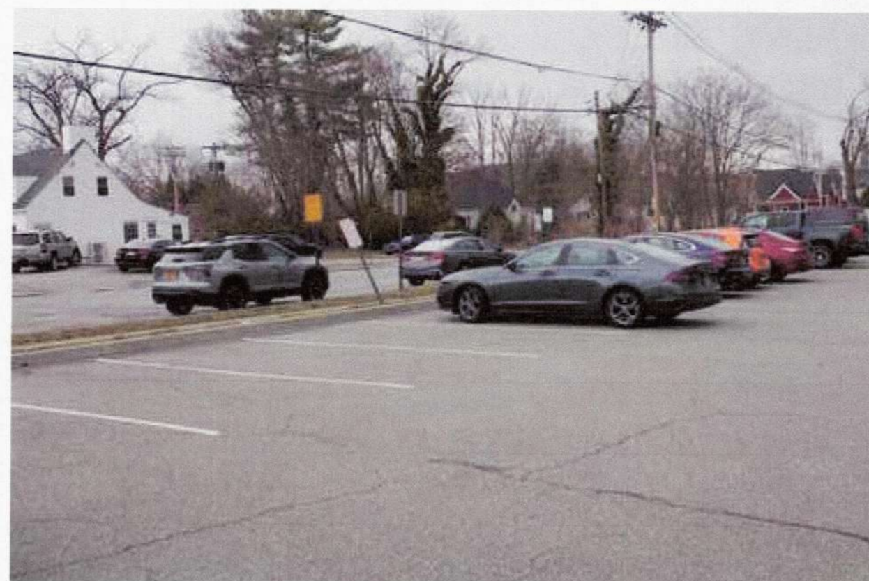
DATE: 3/26/2025 TIME: 1:50PM